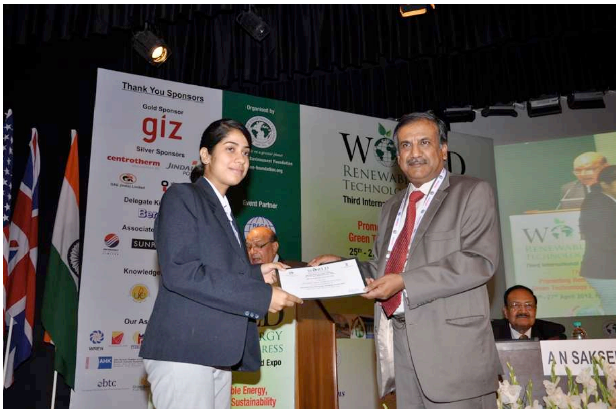
EMPI Student receiving Certificate for Participation