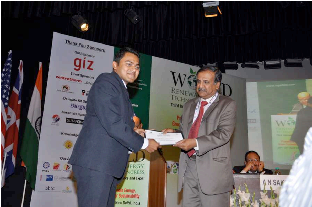
EMPI Student receiving Certificate for Participation